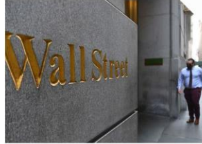
STOCK & FOREX